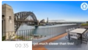
Is this the closet home to the Harbour Bridge?