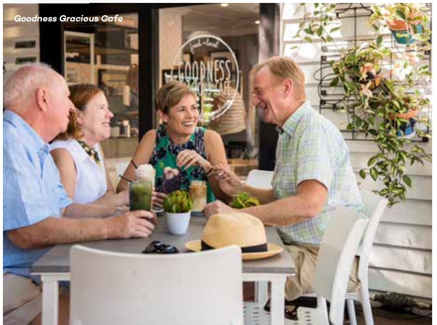
Goodness Gracious Cafe