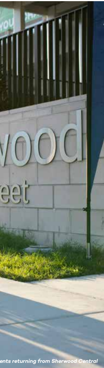
Residents returning from Sherwood Central

One of the beauties of Sherwood is the options for transport with the train 2 minutes walk from Arbor. Just around the corner from Arbor, Oxley Road is also serviced by buses with the 599 travelling direct to Indooroopilly Shopping Centre Bus Station on a regular basis.