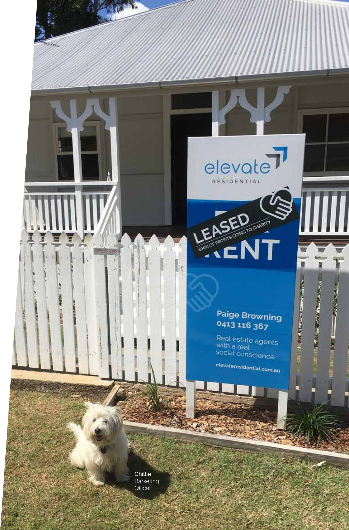
Ghillie Barketing Officer