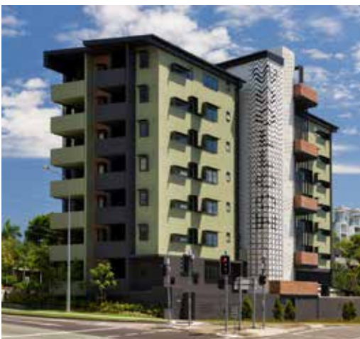
Cornwall Street, Woolloongabba