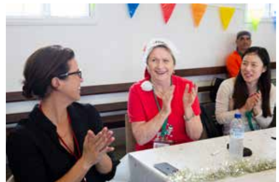
2023 Resident End of Year Celebration